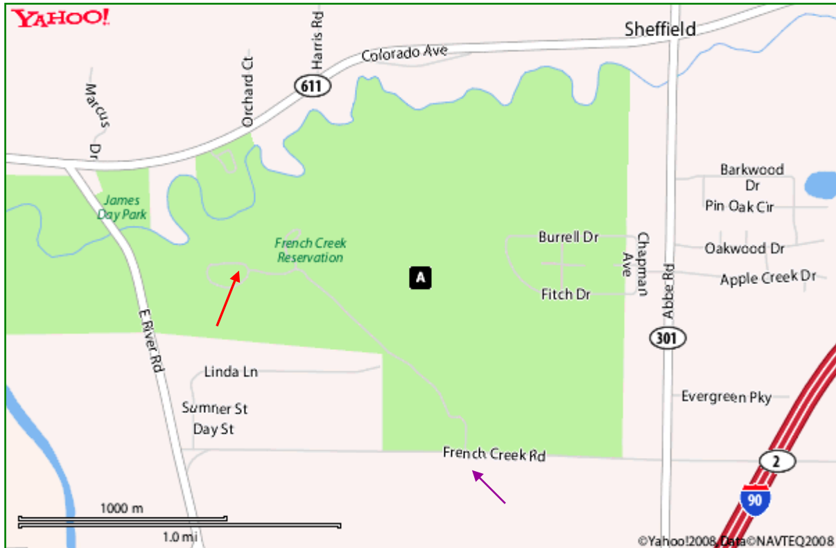
The purple arrow on map indicates the entrance to the parkway and the red arrow shows the pavilion/parking location.

Each member is asked to bring an item to share: Last name initial A-F = salad dish or appetizer; J – R = vegetable or fruit; S – Z = dessert