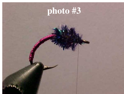
Photo # 3 Tie in the brightly colored ice chenille and make a few wraps toward the eye. Do not crowd the eye. Leave room for the last stage of tying in the shroud.

Photo # 2 Tie in the metallic braid thread and bring your tying thread to 1/4" from the eye. Wind the metallic thread, edge to edge, along the shank to the 1/4" spot from the eye. This will form a solid color hook shank.