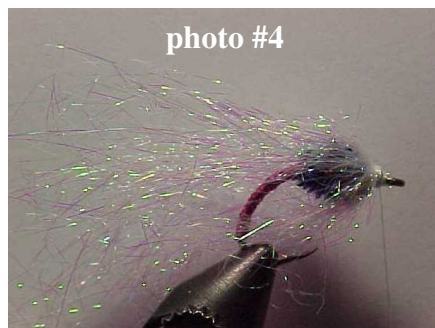
Photo # 4 Double over a bundle of "Ice Dubbing" and tie it in near the eye. Allow it to fan around the hook shank as you lock it in. Fold over the excess toward the bend to create a complete shroud around the hook. Whip finish a head.

Photo # 3 Tie in the brightly colored ice chenille and make a few wraps toward the eye. Do not crowd the eye. Leave room for the last stage of tying in the shroud.