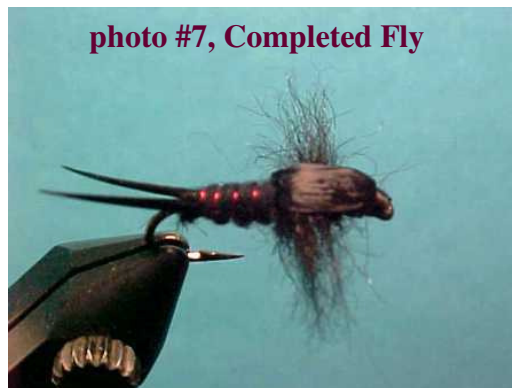
Photo # 7 Use a bodkin needle or velcro to pick out the fibers of the thorax to form legs and gills. This is the completed fly.

Photo # 6 Flop the swiss straw over the top of the dubbed thorax to form the wing shell casing. Form a head and whip finish the thread. Trim off the thread.