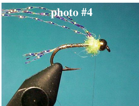
Photo # 4 Dub in a fine head of the Ice Dub just behind the bead. Place about 6 wraps behind the excess Crystal Flash, and then about 3 wraps in front "over the top" of the excess Crystal Flash to lay it backwards.

Photo # 3 Take the excess Crystal Flash and wrap the hook shank up to the eye in an even layer. Leave the excess facing the top of the hook when you tie it in. Do not cut off the excess.