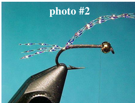
Photo # 2 Select 4 strands of the Crystal Flash and tie in a tail to extend out beyond the bend by about 1/2 of the length of the hook shank. Do not trim off the excess. Bring the thread up to the bead.

Photo # 1 Install the bead on the hook and slide it up to the hook eye. Start your thread on the hook shank in an even layer from the eye to the bend.