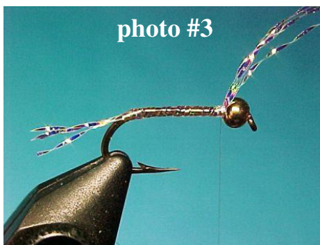
Photo # 3 Take the excess Crystal Flash and wrap the hook shank up to the eye in an even layer. Leave the excess facing the top of the hook when you tie it in. Do not cut off the excess.

Photo # 2 Select 4 strands of the Crystal Flash and tie in a tail to extend out beyond the bend by about 1/2 of the length of the hook shank. Do not trim off the excess. Bring the thread up to the bead.