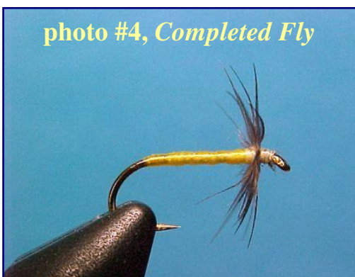
Photo # 4 Wrap the feather one to two revolutions around the hook and tie it off. Trim off the excess and whip finish a head. Trim off the excess thread and seal the head with cement. This is the completed fly.

This soft hackle is considered a traditional fly pattern and can be highly effective when fished properly. It can be swung, used as a dropper or even lightly stripped near feeding fish. You can also tie with guinea or partridge feathers and many different body colors.