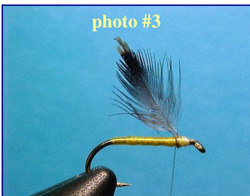
Photo # 3 Prep a single feather from the starling neck. Tie in the feather post.

Photo # 2 Wrap the silk floss back to the start of the bend and then over wrap back to the tie in point near the eye. Tie off the silk and trim off the excess.