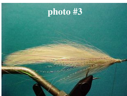
Photo # 3 Select a pinch of white buck tail fur and remove the under fur. Stack it so the tips are close to uniform. Measure the length to be about 1- 1/2 the hook shank length. Tie in a small bundle of white buck tail on each side of the hook shank so it comes about 1" short of the tail length. Select about 12 to 15 strands of the pearl Krystal Flash and tie them in at the mid point of the strands and allow them to double back on each side of the deer fur. Trim the Krystal Flash to exceed the length of the deer fur by about 1/2".

Photo # 2 Select two pairs of white hackle feathers to form the tail. Match two so the natural curve is faced inward to the hook. Measure just over 2 hook shank lengths and tie them in so the curve is faced inward to the hook. Match the other two feathers and tie them in on the opposite side to face inward to the hook. The shape should look inward like (( )) Not outward like )) ((. Select about 8 to 10 full length strands of the pearl Flashabou. Tie them in at the mid point of the strands where you tied in the tail feathers. Allow them to double back on both sides of the tail feathers. Trim the Flashabou to length about 1/2" beyond the tips of the tail feathers. Bring the thread to the hook eye for the next step.