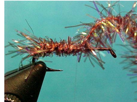
Photo # 3 Tie in a section of Swiss Straw on the top of the hook at the mid point.

Photo # 2 Spiral wrap the Estaz to the mid point of the shank and tie it off. Do not trim off the excess Estaz. Move the excess Estaz out of the way of the back section of the fly. Trim off the hackles of Estaz that is already wrapped from the tail to the midpoint. This creates a slender tail section of the nymph body. Make sure that you do not trim off the tail hackles that stick out beyond the hook bend.