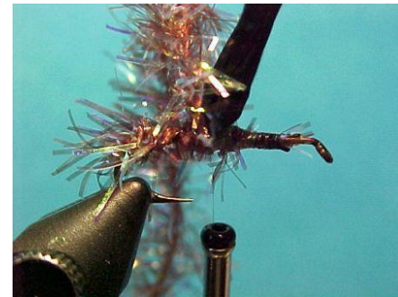
Photo # 5 Flop the Swiss Straw over the top of the front section of the hook and tie it off at the eye. Form a head of thread and whip finish the tread. Trim off the excess thread. This is a picture of the completed fly.

Photo # 4 Bring the thread to the hook eye. Spiral wrap the balance of the Estaz to the hook eye and tie it off. Trim any excess.