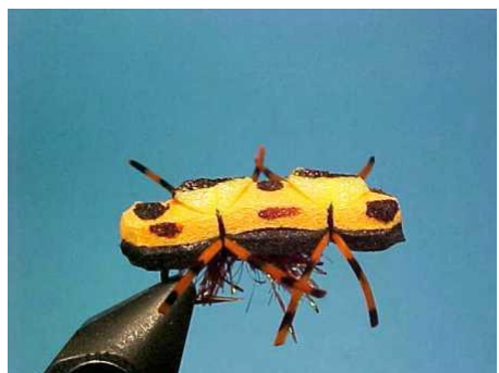
Photo # 4 Bring the thread below the foam to the hook eye and tie it off with 5 half hitches. Add black accent stripes to the legs with a Sharpie permanent marker pen. Add a few black dots along the body to break up the solid orange and yellow coloration. Touch the orange and black tips together with "Super Glue." Trim off the front and rear to bevel the body into rounded ends to complete the fly.

Photo # 3 Tie down the black, orange and a small portion of the yellow foam at this position again. Add the living rubber legs as you did on the last step.