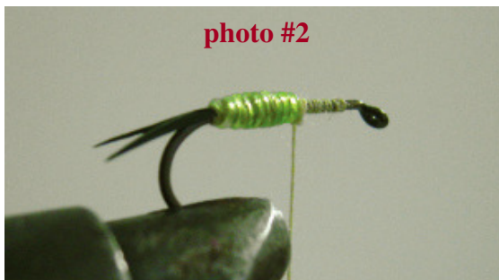
Photo # 2 Then, wrap the thread around the shank, so the bottom half of the hook is peach (or lime). Right where the tail of the fly begins, tie on a piece of florescent green larva lace. Wrap the lace over the peach (or lime) thread and tie off half way up the shank.

Photo # 1 Start creating this fly by using a size 6 to 10 Mustad #3906B. Be sure to use a peach colored (or lime), stretch thread or something similar for this particular color scheme. Tie on two black goose biots for the tail, to create a forking effect, similar to a stone fly tail.