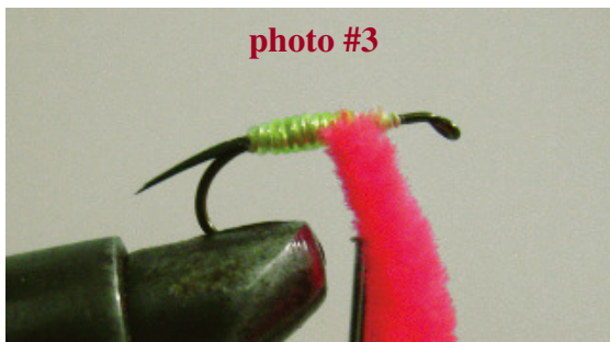
Photo # 3 Next, cut a piece of peach chenille, and pull the fabric off one end to expose the string for easy and neat tying. Tie the chenille on, just above the larva lace and create an egg-shaped ball.

Photo # 2 Then, wrap the thread around the shank, so the bottom half of the hook is peach (or lime). Right where the tail of the fly begins, tie on a piece of florescent green larva lace. Wrap the lace over the peach (or lime) thread and tie off half way up the shank.