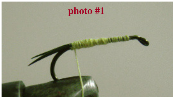
Photo # 1 Start creating this fly by using a size 6 to 10 Mustad #3906B. Be sure to use a peach colored (or lime), stretch thread or something similar for this particular color scheme. Tie on two black goose biots for the tail, to create a forking effect, similar to a stone fly tail.