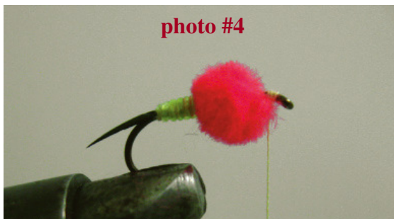
Photo # 4 Be sure not to make the egg too close to the eye, because there is one last step remaining, and you'll need the room. With this in mind, tie on two more goose biots for wings.

Photo # 3 Next, cut a piece of peach chenille, and pull the fabric off one end to expose the string for easy and neat tying. Tie the chenille on, just above the larva lace and create an egg-shaped ball.