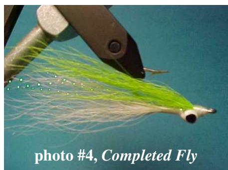
Photo # 4 Flip the hook over in your vise, or invert your rotary vise. Tie in a pinch of Chartreuse buck tail over the top of the crystal flash at the head only. Do not carry the thread down the hook shank as earlier with the white. Whip finish a head and add head cement to finish.

Photo # 3 Tie in about 4 strands of Krystal flash at the eye and double it back over to the length of the tail. Keep it below the white buck tail so it will assume a level position along the hook shank.