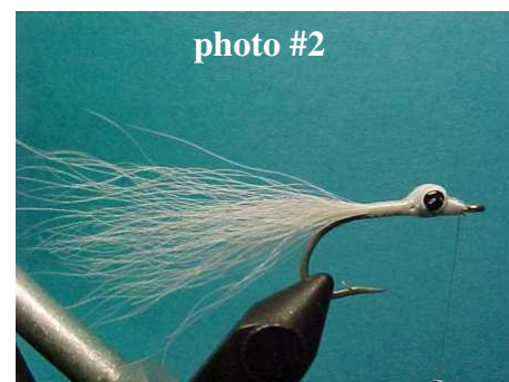
Photo # 2 Tie in a slender pinch of white buck tail fur in front of the weighted eyes. Carry the tying thread through the lead eyes and bind the bucktail down directly behind the eyes to about half way down the hook shank. Wrap the thread back forward to the front of the eyes. Keep the white buck tail fur on top of the hook shank. Do not allow the hair to wrap around the hook shank.

Photo # 1 Secure a solid base of thread on the first 1/2 of the hook shank near the eye. Measure back about 1/4" from the hook eye and use a figure 8 wrap to tie in the weighted eyes on the top of the hook shank. This will allow the weighted eyes to flip the hook over in the water with the point upward. You can apply head cement or glue if needed to keep the eyes solid to the hook.