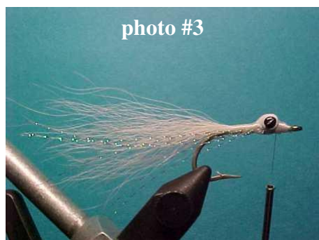
Photo # 3 Tie in about 4 strands of Krystal flash at the eye and double it back over to the length of the tail. Keep it below the white buck tail so it will assume a level position along the hook shank.

Photo # 2 Tie in a slender pinch of white buck tail fur in front of the weighted eyes. Carry the tying thread through the lead eyes and bind the bucktail down directly behind the eyes to about half way down the hook shank. Wrap the thread back forward to the front of the eyes. Keep the white buck tail fur on top of the hook shank. Do not allow the hair to wrap around the hook shank.