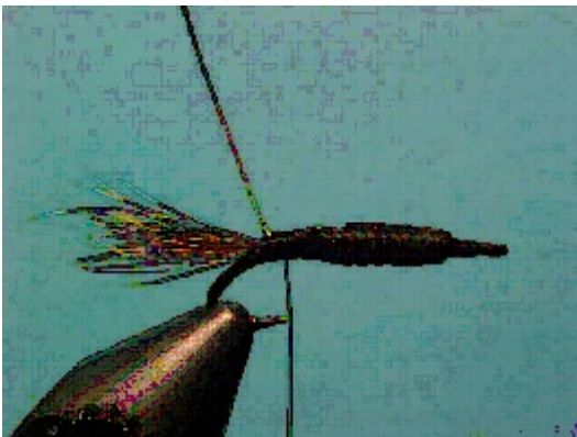
Photo # 2 Stack a pinch of red fox squirrel body fur and tie it in as a tail. Tie in a length of wire or tinsel to be used later.

Photo # 1 Tie in the thread. Wrap the lead wire around the hook shank and keep it in the first third of the hook shank. Over wrap the lead wire with the thread and bring the thread to the top of the hook bend.