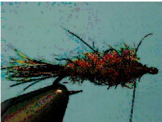
Photo # 5 Tie in a Hungarian Partridge body feather and make two to three wraps to form a soft hackle. Form a head and whip finish the thread. Trim off the thread and add a dab of head cement. Brush the body with Velcro to make a buggy appearance.

Photo # 4 Dub in the thorax with the darker color red fox squirrel fur mixed with the Antron dubbing.