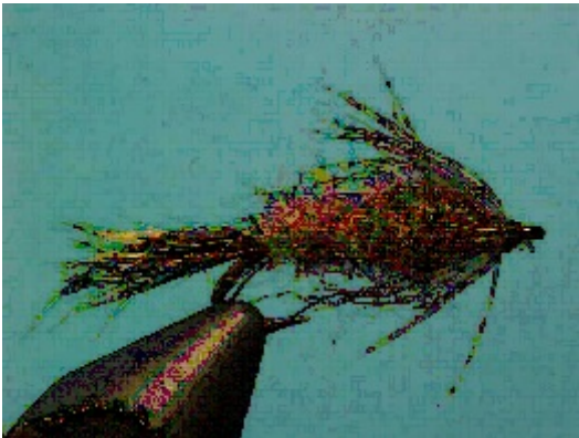
Photo # 4 Dub in the thorax with the darker color red fox squirrel fur mixed with the Antron dubbing.

Photo # 3 Dub in a body of the lighter color red fox squirrel fur mixed with the Antron dubbing. Dub the abdomen only to the 2/3 point to allow room for the Thorax. Spiral wrap the wire over the abdomen dubbing. Leave room in between the wraps to expose the dubbing in between. Tie off the wire.