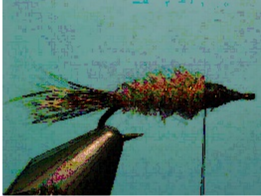
Photo # 3 Dub in a body of the lighter color red fox squirrel fur mixed with the Antron dubbing. Dub the abdomen only to the 2/3 point to allow room for the Thorax. Spiral wrap the wire over the abdomen dubbing. Leave room in between the wraps to expose the dubbing in between. Tie off the wire.