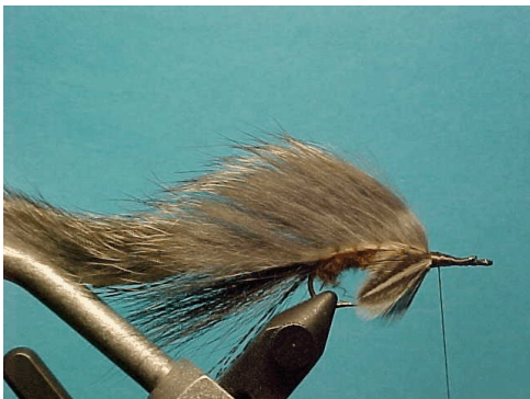
Picture #5 Clean and strip off two grouse feathers. Tie in one as pictured on an outward and slightly downward angle to imitate the pectoral fin. Flip the fly over and tie in the opposite side with the same outward and downward angle.