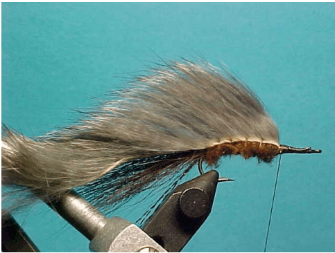
Picture #4 Tie in the rabbit Zonker strip on the dorsal side of the hook shank and let it flow out past the fur tail. Trim the length of the zonker tail to make the fly 2 to 3 inches total length. Take your bodkin and spread the rabbit fur at the point where the #4 mono is tied in. Wrap the #4 mono over the rabbit leather where you spread the fur. Take caution to just contact the leather to keep the fur from being pinched down. Move up toward the eye about 1/4" and spread the rabbit fur again. Wrap the #4 mono around the body again to tie in the leather again. Proceed another few more times to complete the Matuka style tie in. Tie off the mono and trim off the excess. Do not cut the thread.