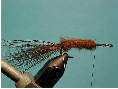
Picture # 3 Trim the fuzzy bottom hurls of the schlappen feather and dub the fuzzy hurls into a body. Wrap only to the 3/4 point of the hook shank.