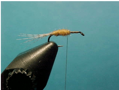
Photo # 2 Dub a tapered body in to about 3/5 of the hook shank up to the hook eye.

Photo # 1 Tie in a base of thread. Measure the tail fibers to the length of the hook shank. Tie in about 8 tail fibers to extend beyond the hook bend, equal to the length of the hook shank.