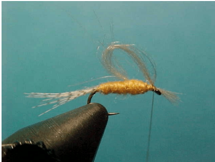
Photo # 5 Bend the CDC feather over forming a loose loop to meet the hook. Tie it in and trim off the excess feather that sticks out over the hook eye. Whip finish a head.