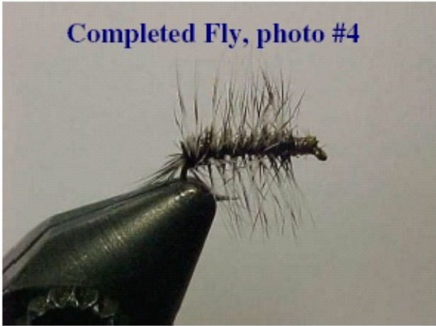
Photo # 4 Spiral wrap the grizzly hackle to the eye and tie off. Whip finish and apply head cement.

Technique: Drift as a dry fly in the film as trout are feeding on midges.