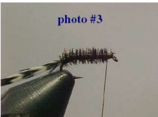
Photo # 3 Wrap the thread forward to the eye, then wrap the peacock herl to just short of the eye and tie off.

Photo # 2 Tie in the peacock herl at the bend.