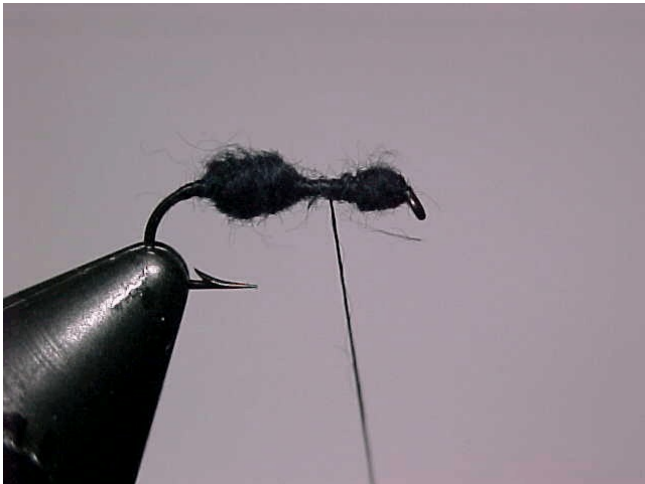
Figure 4) Move the thread forward toward the eye and dub in a smaller ball for the head.