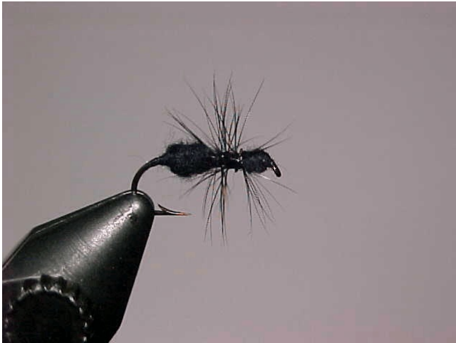
Figure 7) Completed Ant Pattern fly.