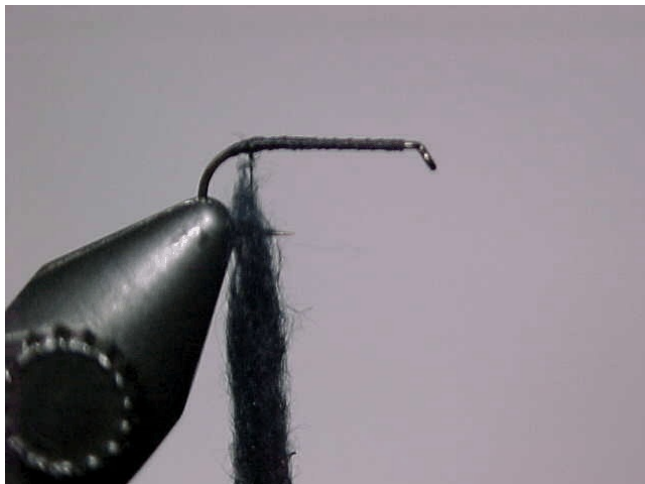
Figure 2) Spin a rope of fine dubbing onto the thread.