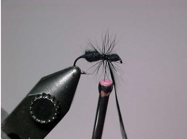
Figure 6) Wrap the hackle 3 to 4 times around the hook shank and tie it in with the thread. Whip finish the thread to complete the fly. Add head cement if desired.