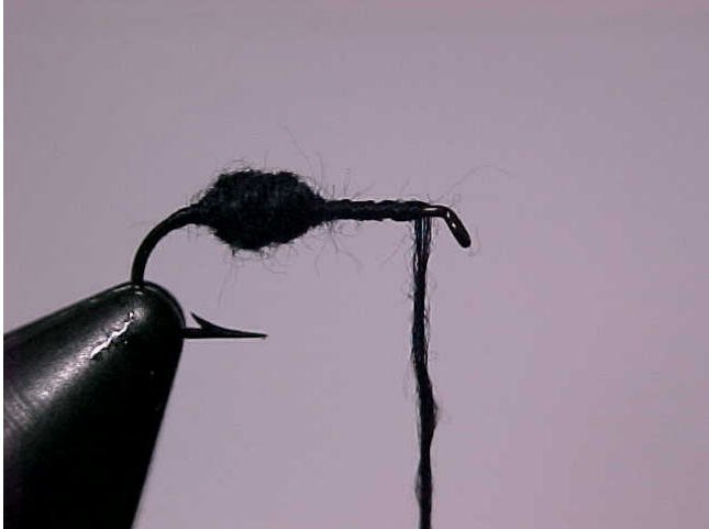
Figure 3) Dub in the abdomen to form a ball at the rear of the shank near the bend.