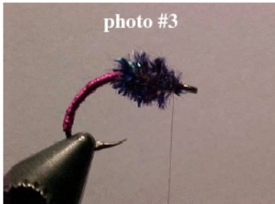
Photo # 3 Tie in the brightly colored ice chenille and make a few wraps toward the eye. Do not crowd the eye. Leave room for the last stage of tying in the shroud.