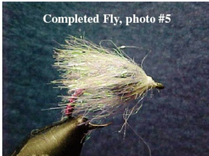
Photo # 5 Trim the excess shroud to be about even with the bend of the hook. Brush backward on the trimmed Ice Dubbing fibers to rough up the completed fly.

For previous Fly of the Month recipes, please visit our web site at http://www.firelandsflyfishers.org