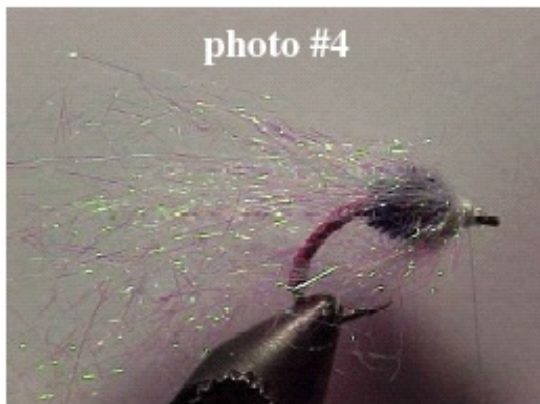
Photo # 4 Double over a bundle of "Ice Dubbing" and tie it in near the eye. Allow it to fan around the hook shank as you lock it in. Fold over the excess toward the bend to create a complete shroud around the hook. Whip finish a head.

Photo # 3 Tie in the brightly colored ice chenille and make a few wraps toward the eye. Do not crowd the eye. Leave room for the last stage of tying in the shroud.